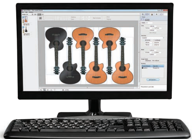
IMAGE NESTING SCREEN

Take the guesswork out of managing color — and get reliable, predictable results and color fidelity performance. The AccurioPro WideDirector features full compatibility with pre-determined ICC profiles, the ability to generate customer profiles and convenient proofing support.